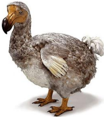
Going the way of the Dodo bird?